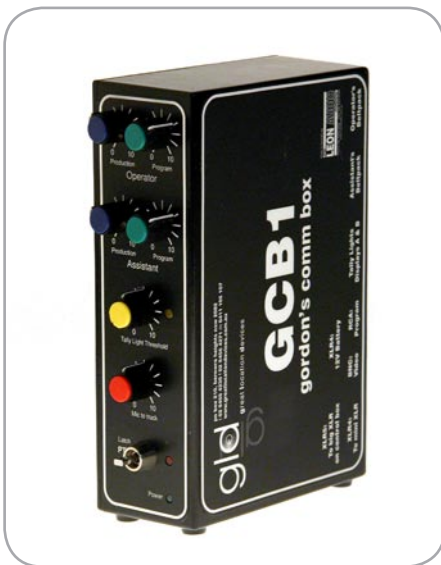
comms box width 55mm, height 185mm, depth 120mm, weight 1.1kg

Only quality powder coated die cast aluminium boxes, connectors and cabling are used and are the 'secret' behind the reliability and durability.